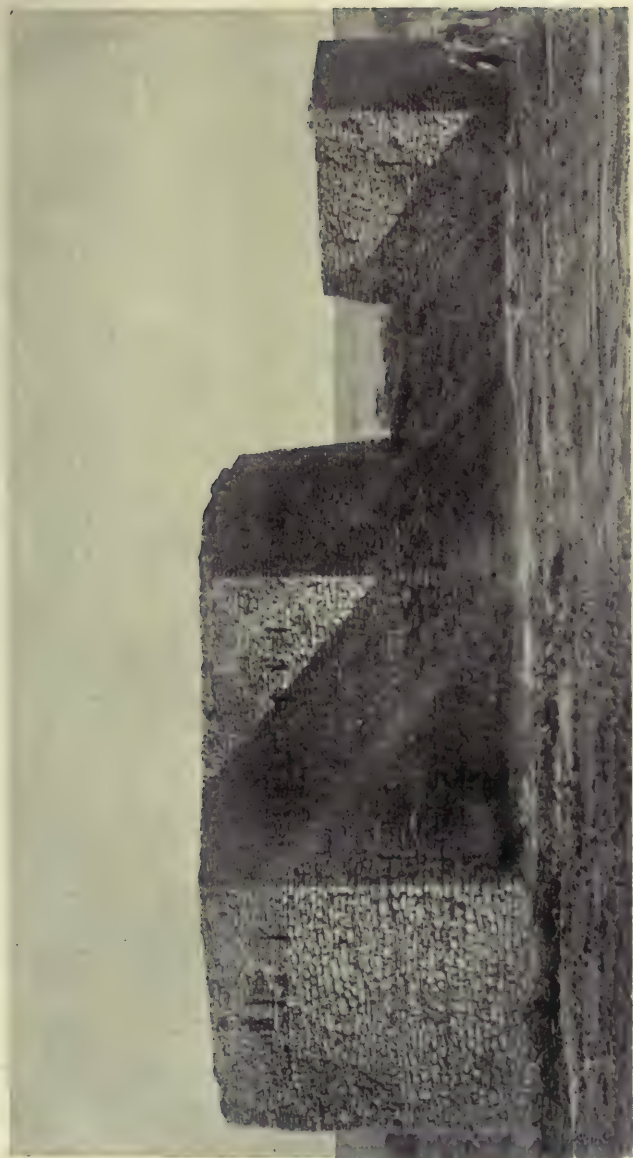
JID ALI FORT FROM THE GROUND.